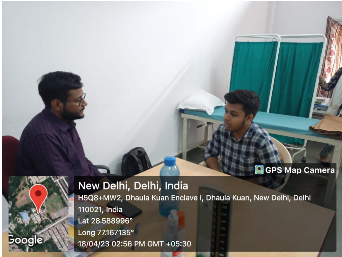
Student interacting with the psychologist at Kiosk Centre