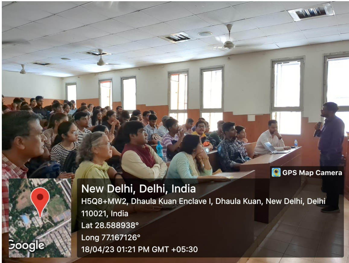
Faculty and students attending the session