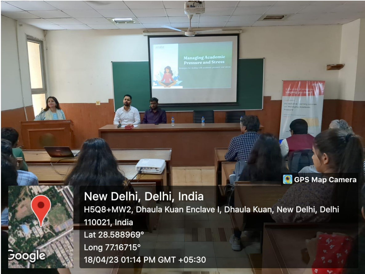
Event's welcome note